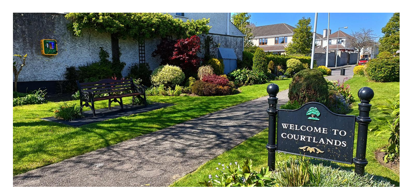
Great efforts on the clean- up days