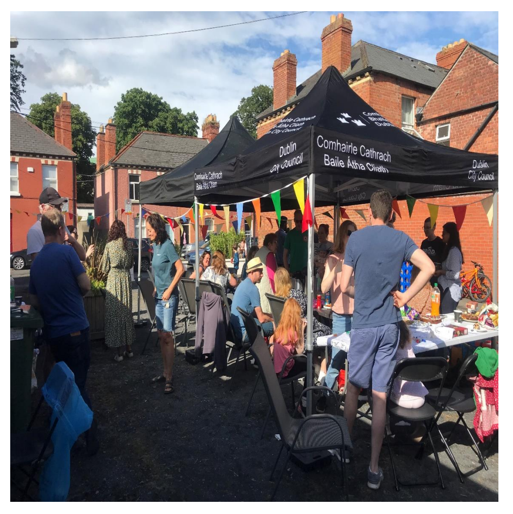
Lemon Square, Drumcondra held a Street Feast on the 25<sup>th</sup> June, 2023.

The Cabra/Glasnevin area is active with almost 100 registered community and environmental groups. This year will see an increase in the number of festivals being held creating huge engagement for the communities across the area.