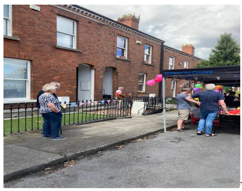
The Provinces Res. Assoc.